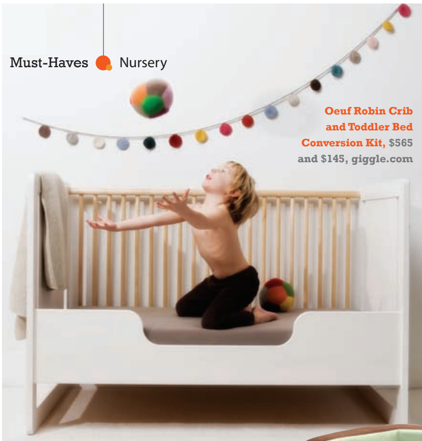
Oeuf Robin Crib and Toddler Bed Conversion Kit, $565 and $145, giggle.com