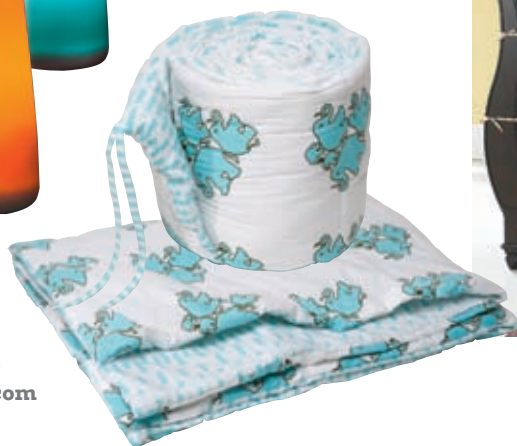
Marnie Rocks Elephant Crib Bedding, $295, marnierocks.com