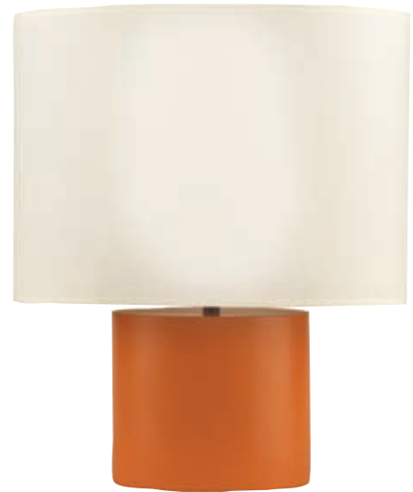
Lights Up Devo Table Lamp with Oval Base in Carrot, $92, designpublic.com