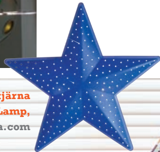
Smila Stjärna Wall Lamp, $10, ikea.com