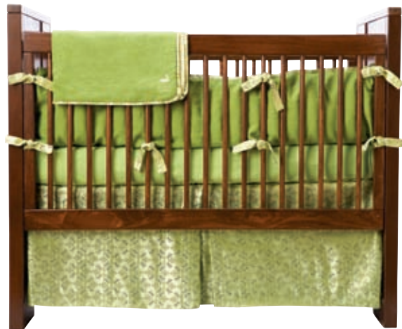
Petunia Pickle Bottom Fawn 5-Piece Crib Set in Botanica Roll, $290, laylagrace.com