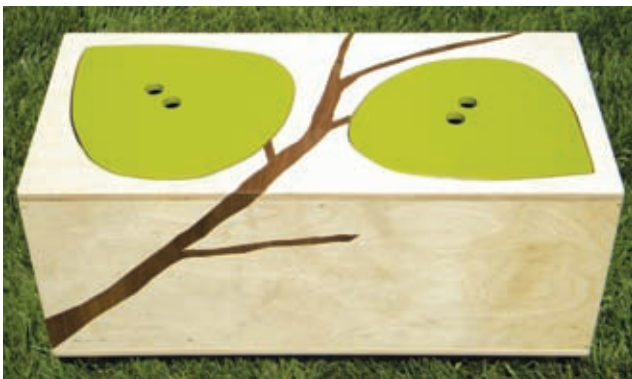
Mod Mom Furniture Owyn Toy Box, $495, designpublic.com