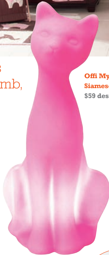
Offi MyPetLamp Siamese in Hot Pink, $59 designpublic.com