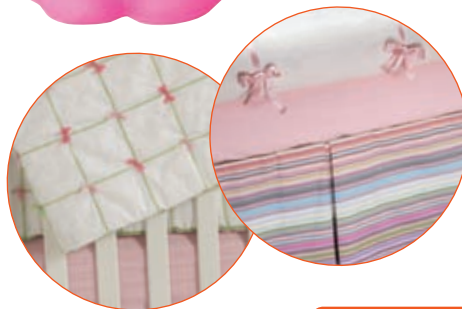
EngageEnvironments 3-Piece Bedding Set in Hopscotch, $650, csnbaby.com