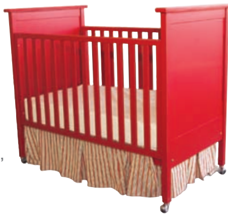
Bratt Decor Dick Crib in Red, $690, brattdecor.com