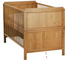
Leksvik Crib (converts to toddler bed), $159, ikea.com