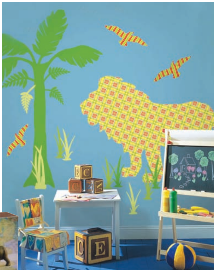
Brewster Wallcoverings ZooWallogy Ozzie the Lion and Palm Tree WallPops, $43 each, usawallpaper.com

And kids respond well to contrasting colors, like the ones found in most animal-inspired prints. There are more options than you imagine—rainforest, jungle, farm, ocean, and domestic animals—the list is nearly endless. Wall decals can be photo-realistic or animated. And don't forget about bugs! Kids also love them and they make for fun inspiration, too.