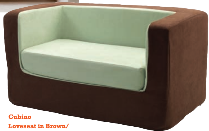
Cubino Loveseat in Brown/Green, $139, montedesign.net

The basic color scheme can be earth tones—sage, cream, and tan—then add pops of bright orange in accessories like lights, rugs, or curtains. Natural materials like baskets can be swapped out later and used in adult spaces. So can paper lanterns, bamboo shades, a sea grass rug, or a rattan chair.