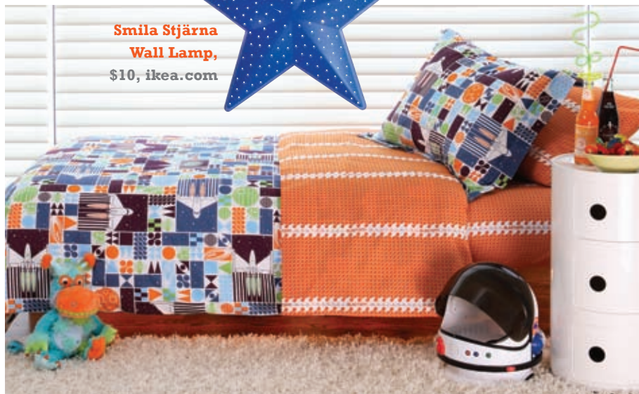
Boodalee Space Collection Twin Duvet and Sheet Set, $190, boodalee.com