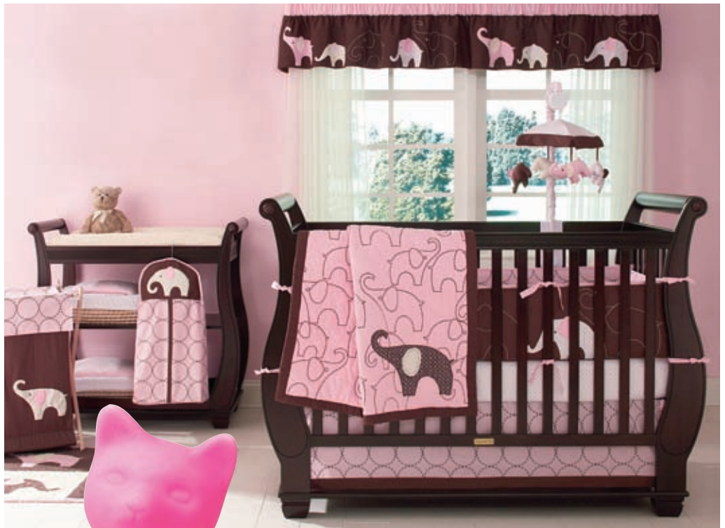
Carter's Elephant Stitch 4-Piece Crib Bedding Set and Accessories $170 for bedding, jcpenney.com