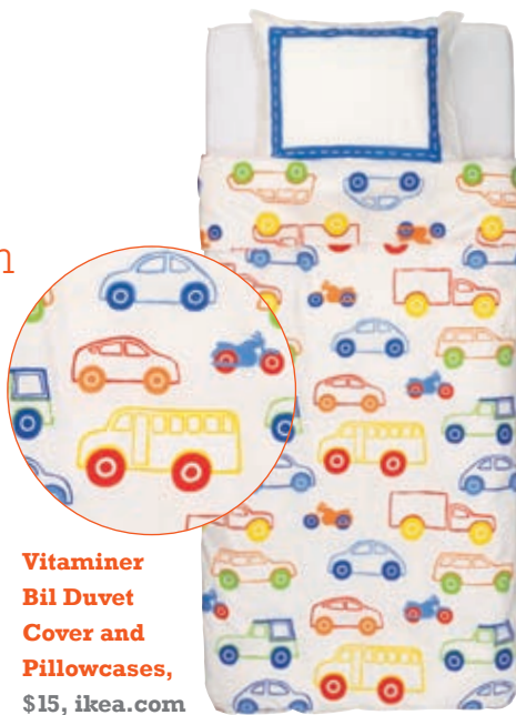
Vitaminer Bil Duvet Cover and Pillowcases, $15, ikea.com

Avoid patterns that may grate on you later. Instead, think larger and three-dimensional. For boys, choose one big airplane decal (leave out the clouds), fun aviation bedding, or a collection of spacecraft models hung from the ceiling. Apply a theme without overwhelming the space—and the brain! In a girls' room, instead of wallpapering the entire room with a bold pattern, use a lighter, quieter counterpart on one accent wall. It will have a more-lasting appeal.