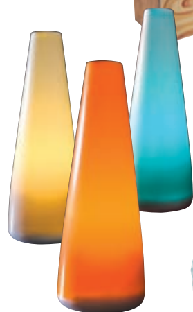
OXO Glow Lights, $40 for a set of 2, OXO Glow Tops in Orange and Blue, $3 each, landofnod.com