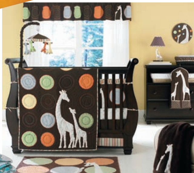
Carter's Tall Tales 4-Piece Crib Bedding Set and Various Accessories, $170 for bedding, toysrus.com